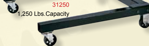
31250 1,250 Lbs.Capacity

SMOOTH ROTATION Heavy duty worm gear allows for smooth and effortless engine rotation