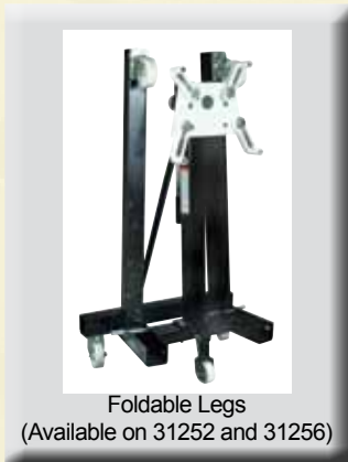
Foldable Legs (Available on 31252 and 31256)

SMOOTH ROTATION Heavy duty worm gear allows for smooth and effortless engine rotation