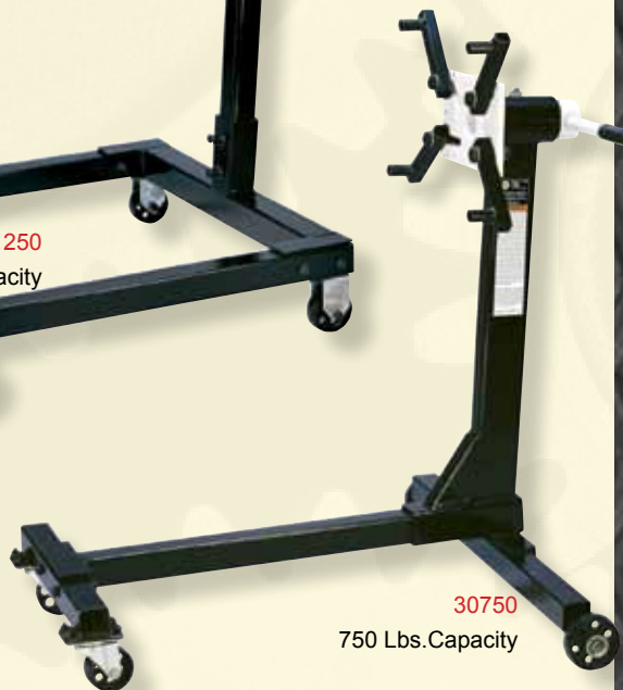
30750 750 Lbs.Capacity