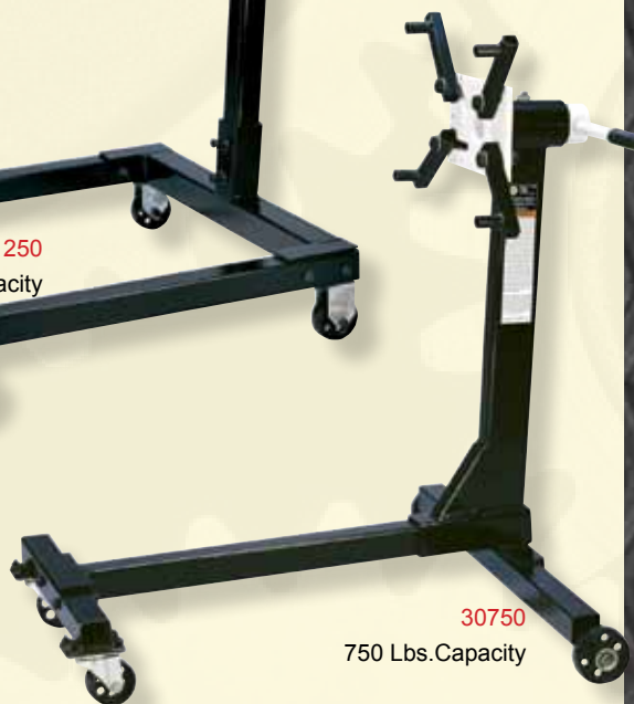
30750 750 Lbs.Capacity