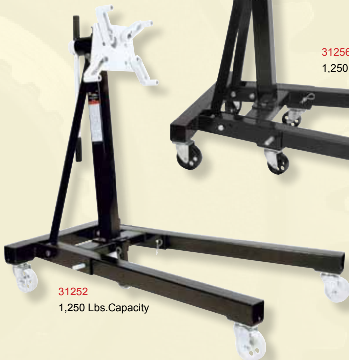
31252 1,250 Lbs.Capacity