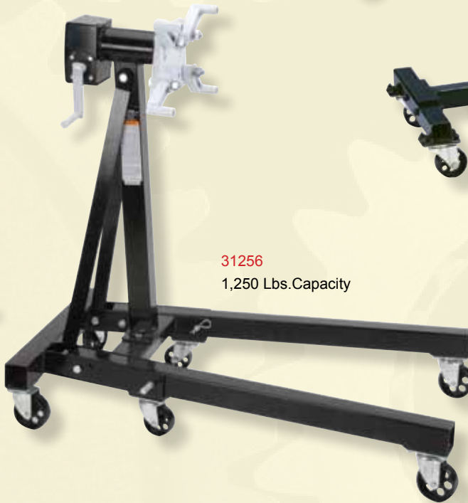
31256 1,250 Lbs.Capacity