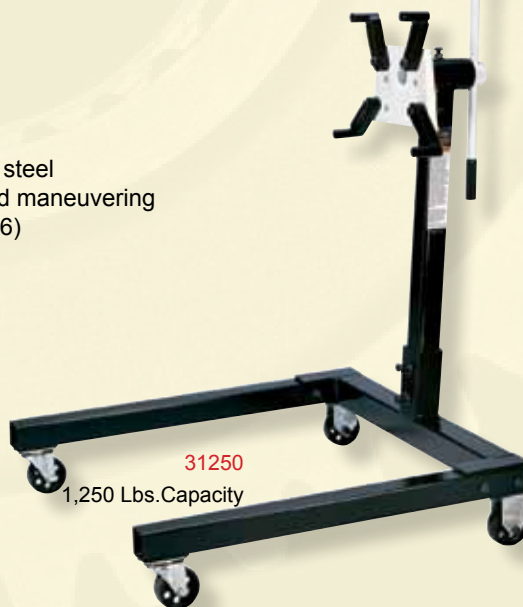
31250 1,250 Lbs.Capacity

SMOOTH ROTATION Heavy duty worm gear allows for smooth and effortless engine rotation